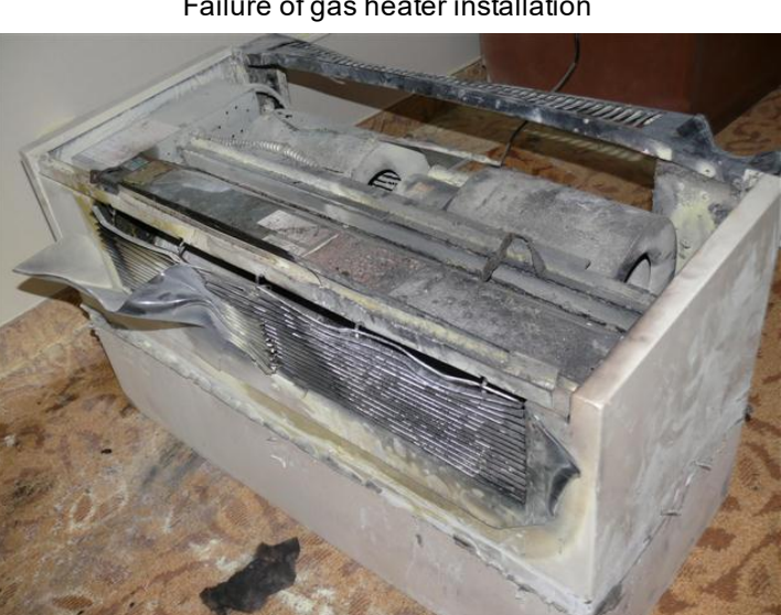
Failure of compressor leads on hotel HVAC unit